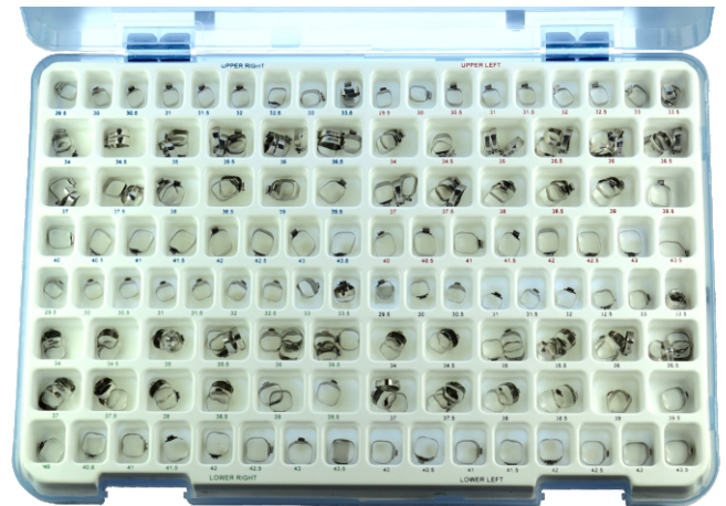
Sturdy box packaging