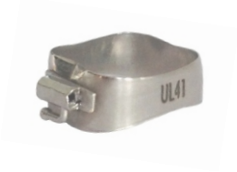
Distribution chart of Pre-welded Molar Bands kits. 400 Bands(100/Quadrant)